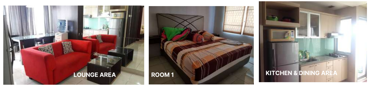
Not in Photo: Room 2, Bathroom Small terrace