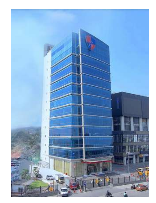
LSPR Trans Park Juanda Jl. Ir. H. Juanda, Duren Jaya, Bekasi Timur, 17113, Indonesia

LSPR Sudirman Park Jl. K.H. Mas Mansyur No.Kav. 35, Jakarta Pusat, 10220, Indonesia