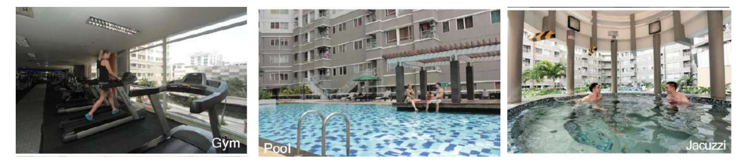
Not in photo: 2 Convenient Stores, FamilyMart, Mini Mart, Coffee Shop, Japanese and Indonesian Restaurants, Laundry services, 24-hr security, Carpark