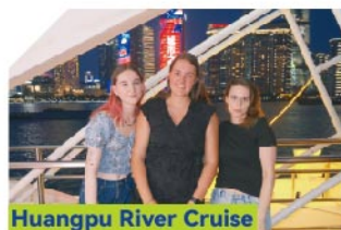
Huangpu River Cruise

Experiencing something and hearing about something are totally different! Abundant cultural activities enable students to experience the Chinese culture and traditions, to achieve multicultural understanding and establish a global vision.