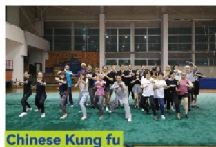
Chinese Kung fu