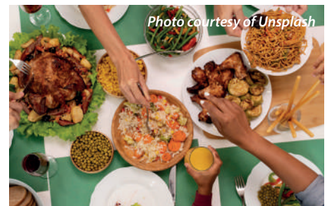
Welcoming & Farewell Meals