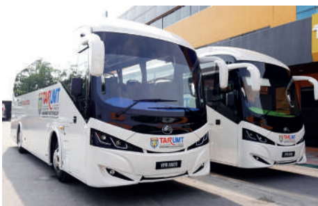
Tours & Transport