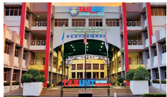
*Study Tour may also be arranged directly through the Penang Campus

*All visits to attractions are subject to weather conditions and other external factors, and may be adjusted accordingly to ensure the safety and comfort of participants