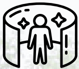
K-CONTENTS IMMERSIVE CLASS

Experience Korea's creative spirit through acting, dance, and K-games! Live on campus, join cultural field trips, and create your own K-contents with friends from around the world.