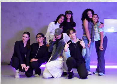
K-POP DANCE ACADEMY