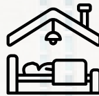
IN-CAMPUS DORMITORY (TWIN-ROOM)