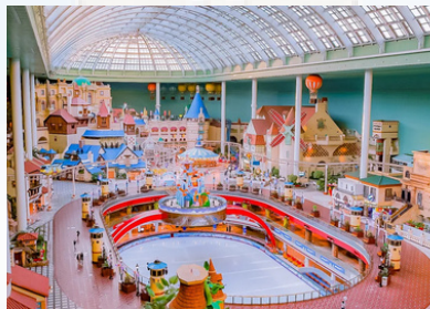
LOTTE AMUSEMENT PARK