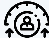
FLEXIBILITY (1 or 2 week)