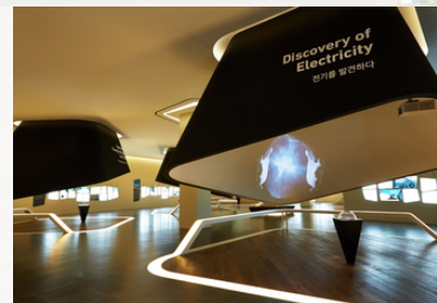
SAMSUNG INNOVATION MUSEUM

※ Field trips may be adjusted depending on circumstances and conditions.