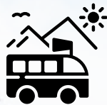
K-CULTURE FIELD EXPERIENCE