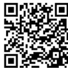
Almaty Cost of Living

Almaty is situated in a mountainous area, which largely influences the climate of the city. The climate here is considered typically humid continental, which means it has hot summers and cold winters. Over the course of the year, the temperature typically varies from -11°C to 30°C and is rarely below -18°C or above 35°C. In spring and early summer months there is a lot more rain than usual.